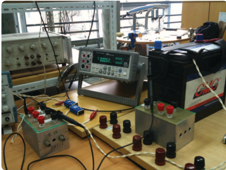
Figure 2. The test configuration includes a switch box with various resistor values and a U3606A to perform resistance measurement.

For this research- the university is using a tungsten coil with various resistor values in a switch box to simulate the resistance in the pixel. The tungsten coil is connected in series with these resistors to understand the behavior of the pixels (Figure 2). Once a desired performance is achieved, the resistance across the switch box and tungsten coil is recorded. This resistance value often falls below 100 milli-ohm. Hence, to measure the resistance accurately, a low range ohm meter is essential.