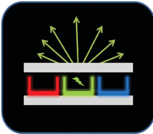
Figure 1. Green color is shown when electrical charge is applied to green sub-cell of a pixel.

A plasma TV screen is constructed of millions of tiny pixels sandwiched between two glass panes. These pixels are filled with inert gas. Within each pixel there are three sub-cells. Each of the three sub-cells is dedicated to a single color phosphor: red, blue or green. When an electrical charge is applied to the sub-cell, the phosphor glows and causes the plasma cell to excite a color (Figure 1). The collective effect of the charged phosphor from each sub-cell creates a better and more accurate color reproduction than LCDs. Plasma pixels also produce deep true blacks, which characterize the superior contrast provided by plasma TVs.